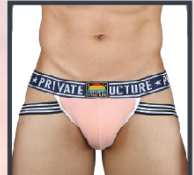
Lemonade Pink B