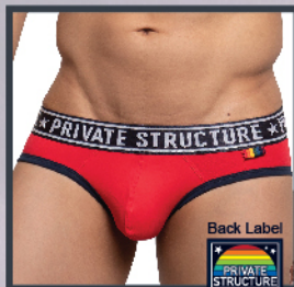
Kissie Red B