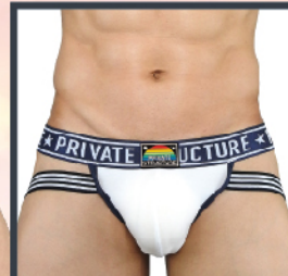
Loadful White B