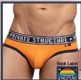
Groovy Orange B