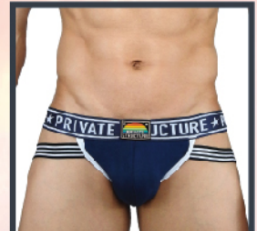
Uniform Navy B