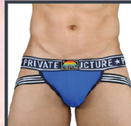
Freedom Blue B